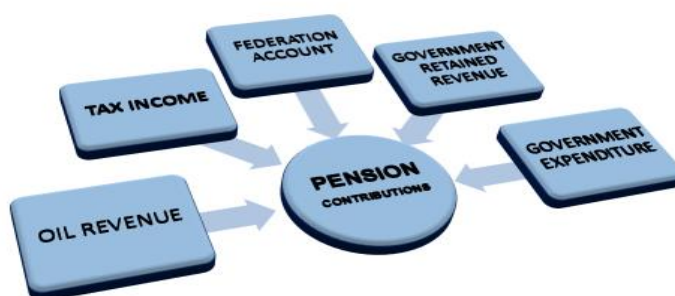
Fig 1: Conceptual Framework